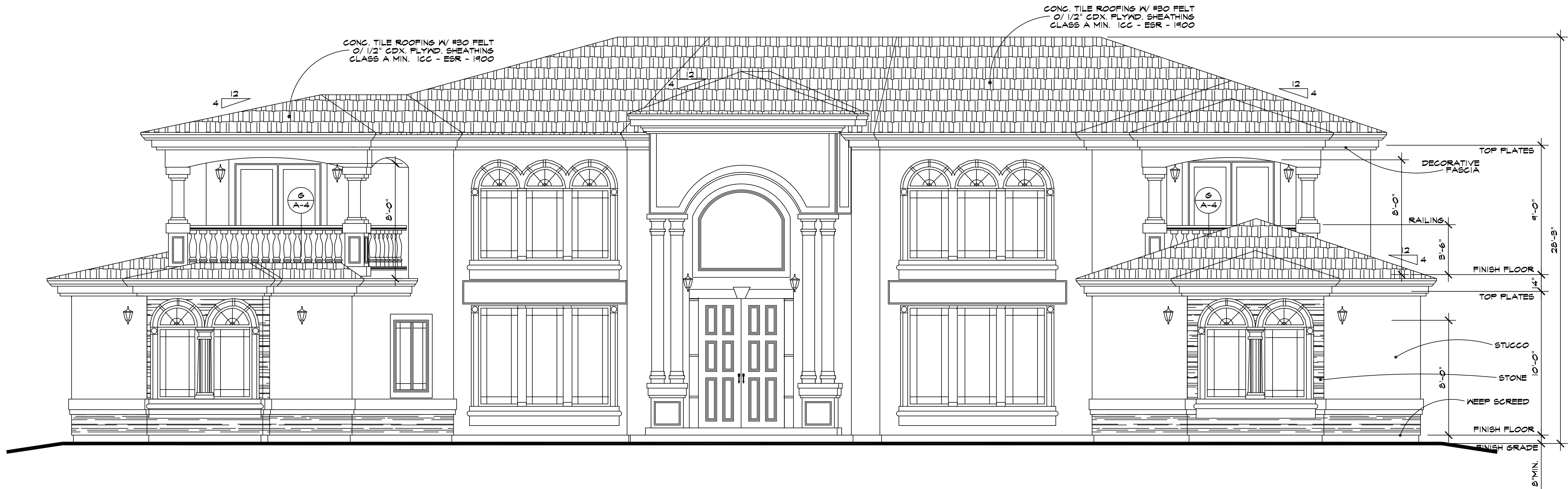
SOUTH-WEST ELEVATION SCALE- 1/4" = 1'-0" FRONT ELEVATION